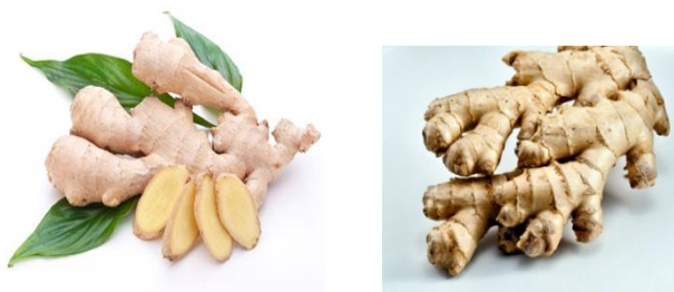
Fig. 1 Rhizome of Zinger officinale