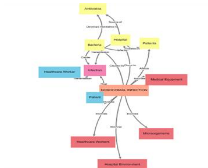
Figure (3): Mind map of nosocomial infection