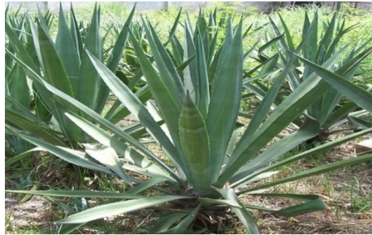
Fig.2: A typical view of sisal plant