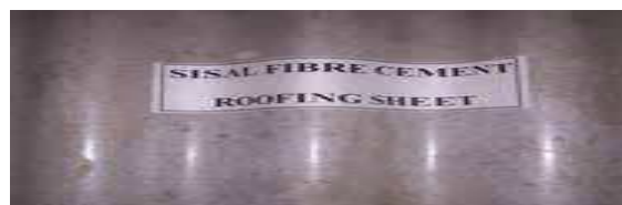
Fig.4: Sisal fiber cement roofing sheet

There is a dire need to widen the product base. Traditional products of twines, ropes, carpets and bags need to be sustained and improved to combat competition. But efforts have to be intensified to produce and market those products where sisal has technological, environmental, geographical and cost advantages. There is a wide range of products like geo textiles, buffing cloth, bonding, construction materials, handicrafts, furniture, padding and mattresses can be made with sisal fiber[8,25]. In recent years sisal has also been utilized as a strengthening agent to replace asbestos and fiberglass and is increasingly a component used in the automobile industry, where its strength, naturalness and environmentally friendly characteristics are greatly appreciated. Attempts were made to prepare Corrugated sisal cement roofing sheets at AMPRI, Bhopal using hand lay up technique as shown in Fig.4 [6,22].