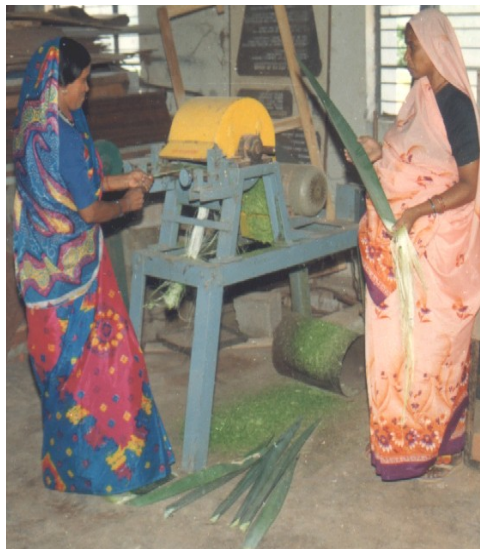
Fig.3: Raspador Machine for sisal fiber extraction

For extraction of the fiber, two methods are employed, viz., the retting process and the mechanical method. The retting process is a biodegradation process involving microbial decomposition of sisal leaves, which separates the fibre from pith. The fibres are washed and processed further. This process takes 15-21 days for a single cycle of extraction and degrades the quality of fibre. At the same time this process is water intensive, unhygienic and not eco-friendly. In the mechanical process, the fibre is extracted by rasping the leaves with a raspador[20]. Raspador is a rotating drum mounted on an axle having blunt blades, fitted obliquely about 10 cm apart on its periphery as shown in Fig.3. The leaves are fed into the slit of the raspador and pulled out. In this method almost the entire extraneous matter is removed leaving only the fibre strand. Decorticated fibres are washed before drying in the sun or by hot air. Proper drying is important as fibre quality depends largely on moisture content. Artificial drying has been found to result in generally better grades of fibre than sun drying. Dry fibres are machine combed and sorted into various grades. Appearance, color and physical properties [28] are the main features to decide the quality standards of sisal fiber as shown in Table 1.