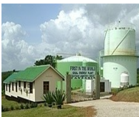
Fig. 4: The Hale biogas plant uses sisal waste to produce electricity established by M/s Katani Ltd, Tanzania.

To make fuel, the residual biomass is fed into a digester along with cow dung [25]. A sisal waste fed biogas power plant was established at Hale by M/s Katani Ltd in Tanzania, as shown in Fig.4 [30]. The bacteria in the dung feed on the crop residues to produce biogas which is then used to generate electricity, used as fuel for transport, cooking and lighting, or for powering farm machinery. Liquid effluent from the process is high in nitrogen, potassium and calcium and is sold as fertiliser to be used on the next generation of sisal crops. The effluent is also used as a nutritious animal feed, which is proving particularly popular with livestock keepers with limited access to grazing lands.