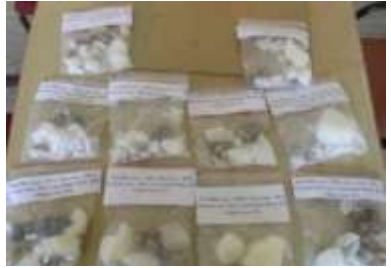
Figure 1, number of sample prepared

3.2 Die design and Pattern Making: - Firstly die is prepared the material of the die is mild steel and the shape and size of the material is shown in the fig