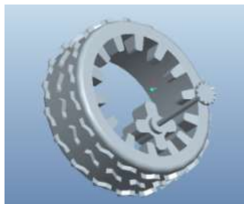
Fig.1 Gear systems in a car wheel.

But the biggest problem is, placing the dynamo in a car is an inefficiency process, that it completely decreases the efficiency of the car. Hence on taking account of this, the working process of the dynamo in a car is completely changed here i.e. every car has to travel in a slope and also it will travel smoothly during when you take off your legs from the acceleration pedal while running. Hence on seeing this situation the dynamos are used to fill up or produce a charge at this time hence you will not loss your efficiency of the car.