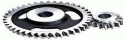
Fig 2 Larger gear connected to smaller gear

The description of this technique is that as you see in the figure 1 we are going to make a gear like system in the wheel and going to fix another small gear in to that so that when a wheel rotates the small gear rotates.