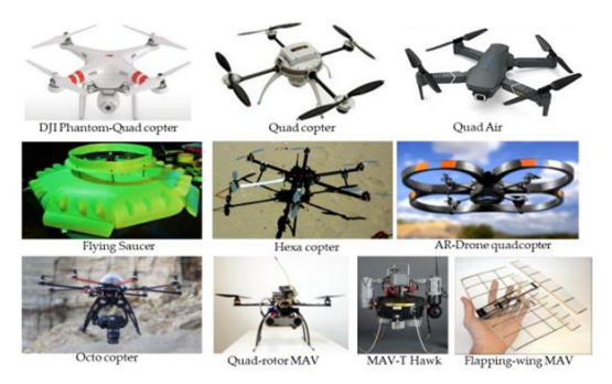
Figure 5. Drone types and designs are based on structure

Over the past decade, the advancement of Unmanned Aerial Vehicles (UAVs) has been remarkable, extending far beyond their original purpose in both civilian and military settings. While initially utilised for tasks such as rescue missions, surveillance, and mapping, UAVs have now become crucial in emergency evacuation efforts and the creation of innovative smart cities. These versatile aircraft have also played a vital role in civil construction projects, efficient real estate management, and monitoring climate patterns. Drones possess distinct classifications determined by factors such as Size, Weight, and Power (SWAP), which significantly impact their flight duration, altitude range, and communication proficiency. The integration of High Altitude Platforms (HAP) elevates communication abilities, leading to a crucial strategic decision between altitude platforms in order to maximise storage and coverage. Although drone advancement has been swift, a thorough evaluation of their evolution and potential remains elusive. The potential for UAV applications to sky rocket from 2010 to 2022 is captured with an emphasis on the integration of cutting-edge fifth-generation (5G) connectivity. This leap in technology enhances the performance of UAVs in multiple areas, including manoeuvrability, scalability, and communication. It's no surprise that the UAV application market is predicted to soar beyond $20 billion in 2022, showcasing its significant impact on a global scale. [1]