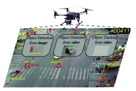
Fig : Object Capture by Drones