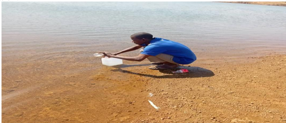
Figure: 1 Sample of Water Collected from Rafin Dutse Stream Water Charachar, Azare

The wastewater sample of Rafin Dutse was collected from charachar near Azare, Katugum Local Government Area of Bauchi State, Nigeria. The water samples were collected by a stratified sampling method from different spot which was shown in figure 1. The samples were used to determine their physical and chemical characteristics before adsorption of activated carbon, the following tests were conducted and shown in table 1 and elements of heavy metals presents such as Cu, Zn, Cd, Pb, Mn, Ni, Fg. etc where determined and shown in table 1.