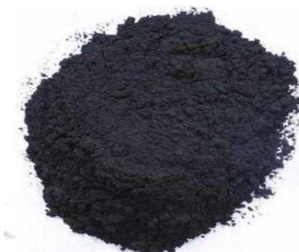
Figure 2(c): Ground Shell Ash (Activated Carbon)