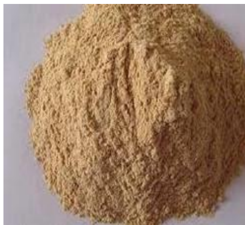
Figure 2(b): Groundnut Shell Powder