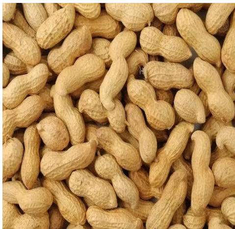
Figure 2(a): Groundnut

The groundnut was obtained from Alkali Market, Alkali local Government Area of Bauchi State, Nigeria. The groundnut sample was separated from peels using threshing method and washed the shell repeatedly with tap water in order to remove all the dirt's and other contaminant. It was further washed with distilled water and sun dried for three (3) days. The dried sample was ground to obtain a powder forms. It was sieved with a 500 \mu m mesh and stored in airtight container, 300g of the powdered sample. The groundnut shell was treated with 1 M solution of K_2CO_3 , ZnCl_2 and KOH. A certain amount of powder was placed in a crucible muffle furnace carbonized at temperature of 400 ^{\circ} C for 2 hours, cooled and then stored in a sealed bag. Thereafter, it was cleaned with distilled water until its pH value was 5.7 and the samples of the groundnut, ground shell and activated carbon were shown in figure 2(a), 2(b) and 2 (c)