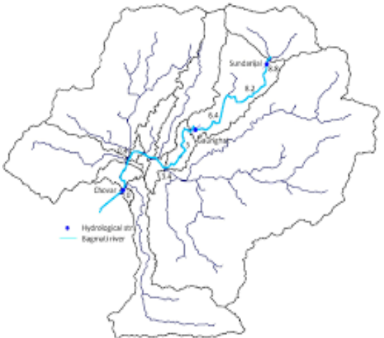
Fig-2: Drainage network of Baghmati River