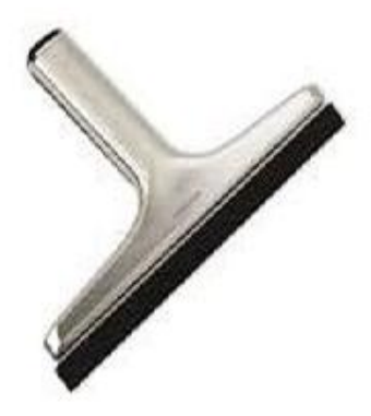
Fig 2 Wiper

Plastic and sponge are used to make the wiper. The pipe is constructed of zinc-coated aluminium. In the machine, a wiper is provided at the end to clean any remaining dust or water. There is a provision to increase the swept area. The wiper used in this project is shown in the (Fig 2).