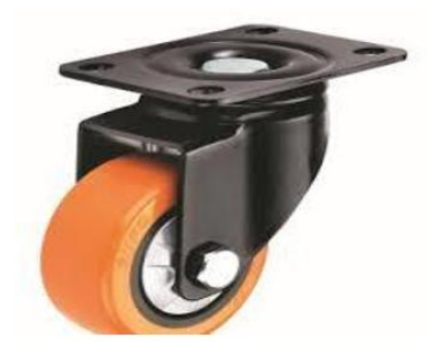
Fig 3 Caster Wheel