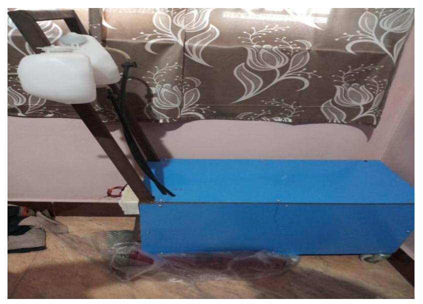
Fig 6-Developed model