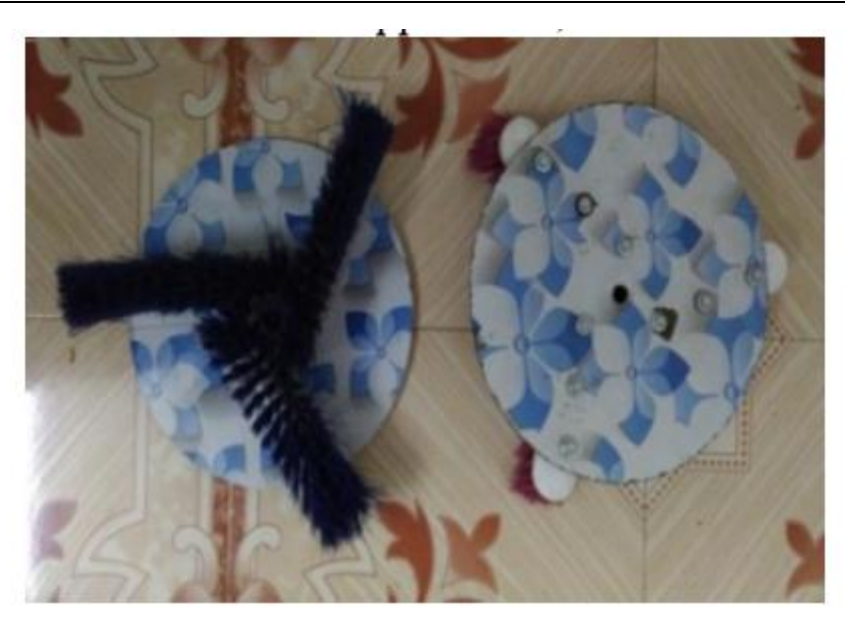
Fig 1 Brush / Scrubber