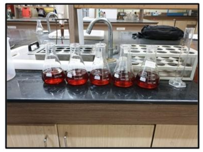
Fig No.1. Test of Total Solids, BOD, COD

Table No.1. Characteristics of Water Sample before treatment