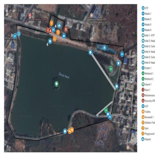
Fig. 3: Satellite view of the lake