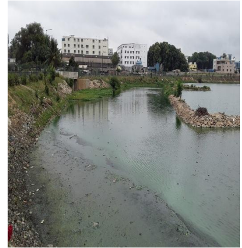
Fig. 4: contamination of the lake