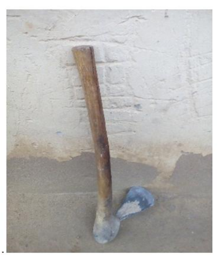
Plate 1; Hoe

Hoe; -This is simple Farm tool with metal bled on its head place on a wooden handed. Use for digging a clay sample.