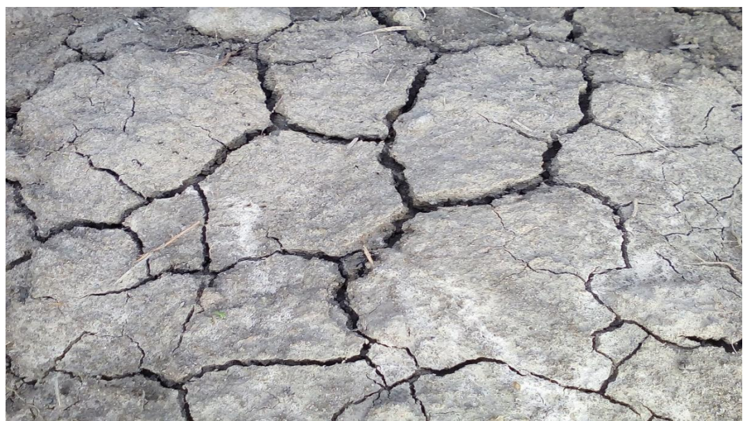
Figure 2 Clay Site at Tunga