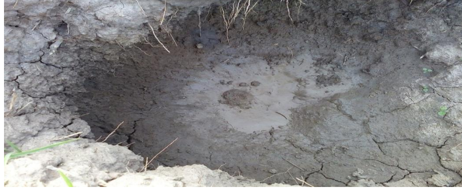
Figure 1 Clay Site at Diggi