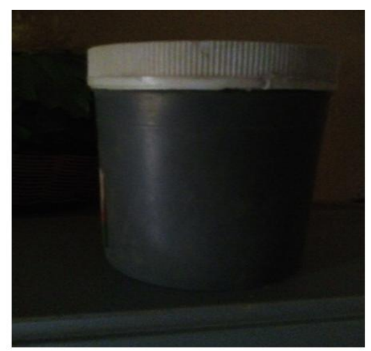
Plate 2 plastic bottle