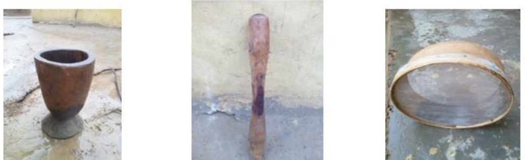
Plate 3; Grinding mortar

Grinding Mortar and Pestle; - those are simple local machine used for grindings the clay sample and resizing of the grain.