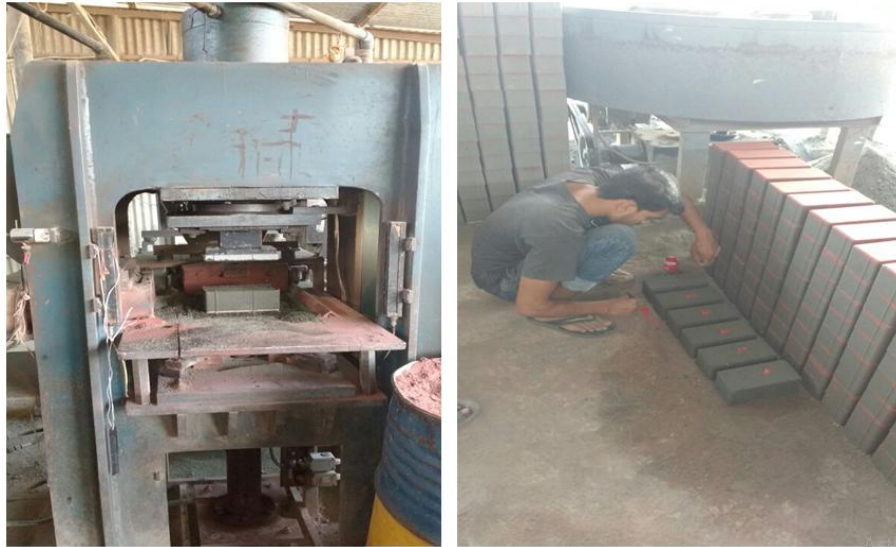
Fig. Casting of Blocks