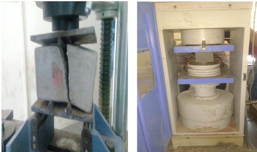
Fig. Testing of Blocks