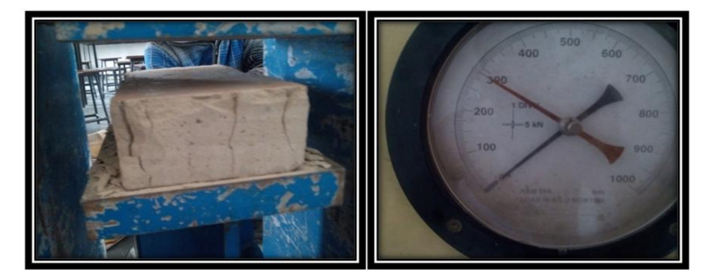
Figure 1: Compressive strength reading of specimen 6