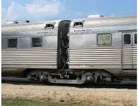
Fig 3:- An articulated bogie of a German ICE