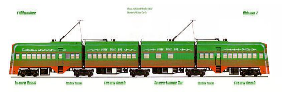
Fig 4:- Schematic diagram showing an articulated Jacobian train.

The cars of these trains are also pressurized to prevent high noise and tunnel booms.[7]