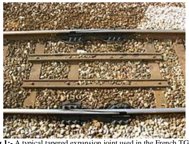
Fig 1:- A typical tapered expansion joint used in the French TGV.

Most modern railways use continuous welded rail (CWR), sometimes referred to as ribbon rails [3]. In this form of track, the rails are welded together by utilising flash butt welding to form one continuous rail that may be several kilometres long. Because there are few joints, this form of track is very strong, gives a smooth ride, and needs less maintenance; trains can travel on it at higher speeds and with less friction. Welded rails are more expensive to lay than jointed tracks, but have much lower maintenance costs. If not restrained, rails would lengthen in hot weather and shrink in cold weather. To provide this restraint, the rail is prevented from moving in relation to the sleeper by use of clips or anchors. Joints are used in continuous welded rail when necessary. usually for signal circuit gaps. Instead of a joint that passes straight across the rail, the two rail ends are sometimes cut at an angle to give a smoother transition. In extreme cases, such as at the end of long bridges, a breather switch (referred to in North America and Britain as an expansion joint) gives a smooth path for the wheels while allowing the end of one rail to expand relative to the next rail. However the Conventional Indian system is still using "fish plates' that may prove very weak for such high speed. They also make 'clip-clap' sounds when the wheel rim passes over them. All the four countries Japan, France, Germany and S.Korea use continuously welded rail tracks with expansion joints.