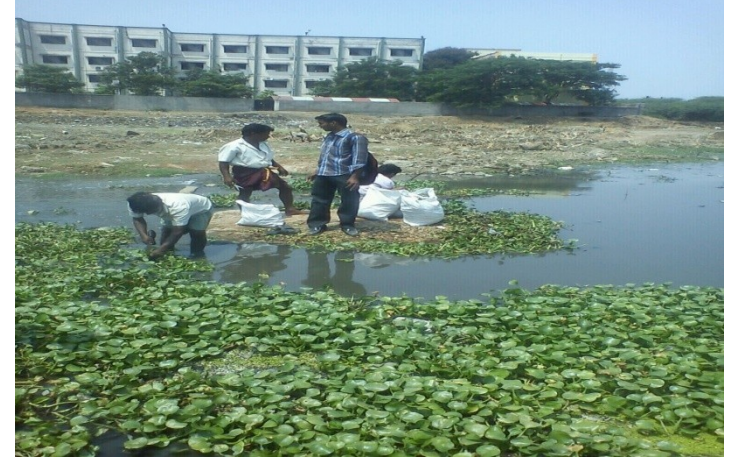
Fig.3. The collection of water hyacinth from the Coovum River for the production of biogas.