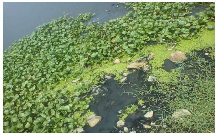
Fig.4. The confluence of sewage, leachets of inorganic and other wastes get stagnated causing accumulation of solid waste as sludge in the river bottom.