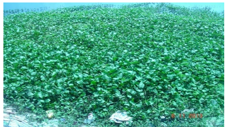
Fig.2. The water hyacinth ( Eichhornia Crassipes ) luxuriant growth on the brink of Coovum River in the chosen site of residents of Coovum.