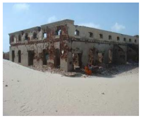
Fig 3: Old Railway station

At present roofless shattered building a church.(Fig.2) Inside, a pedestal, which could have been the altar, stands intact. A ruined railway station (Fig.3) and a temple lie among the debris. But the shells of the structures sit peacefully in dunes of white sand against a deceivingly calm and sparkling blue sea. Railway office made up of stone structure standing with other buildings tells the story of the town. Overhead water tank (Fig.4) supporting structure made with stone masonry with stone lintels in between with arch was fascinating, stands next to railway station. The town also had big post office (Fig.5) built with stone masonry and brick arch openings.