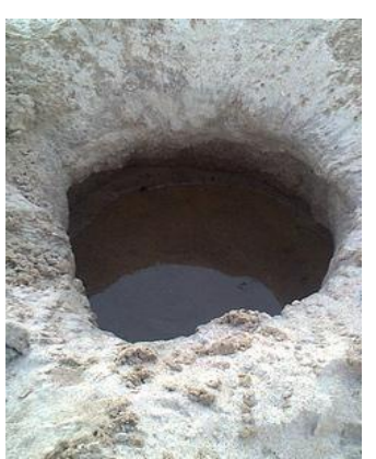
Fig. 9: Small wells provide sweet water