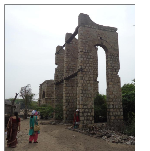
Fig.4: Remains Overhead water tank structure

At present roofless shattered building a church.(Fig.2) Inside, a pedestal, which could have been the altar, stands intact. A ruined railway station (Fig.3) and a temple lie among the debris. But the shells of the structures sit peacefully in dunes of white sand against a deceivingly calm and sparkling blue sea. Railway office made up of stone structure standing with other buildings tells the story of the town. Overhead water tank (Fig.4) supporting structure made with stone masonry with stone lintels in between with arch was fascinating, stands next to railway station. The town also had big post office (Fig.5) built with stone masonry and brick arch openings.