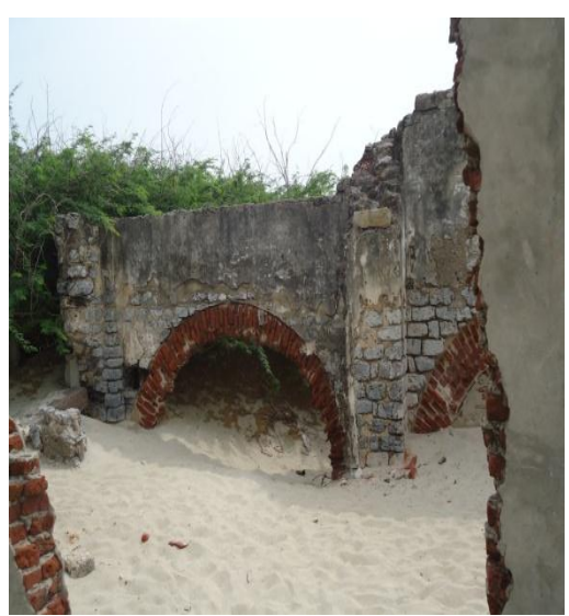
Fig.5: Destroyed post office

A scientific study conducted by the Geological Survey of India indicated that the southern part of erstwhile Dhanushkodi Township facing Gulf of Mannar sank by almost by 5 meters due to vertical tectonic movement of land parallel to the coastline. As a result of this, a patch of land of about half a km in width stretching 7 km along North-South direction submerged in sea along with many places of worship, residential areas, roads etc.