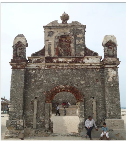
Fig. 2: Destroyed church Dhanushkodi