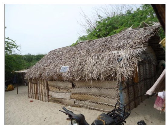
Fig.8: The Thatched huts of the fisher folk