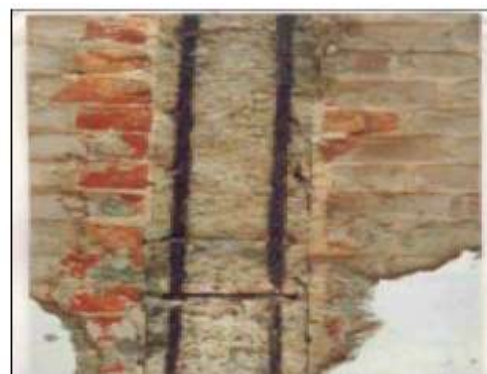
Fig.No-4 Spalled cover concrete & exposed cover Reinforcement