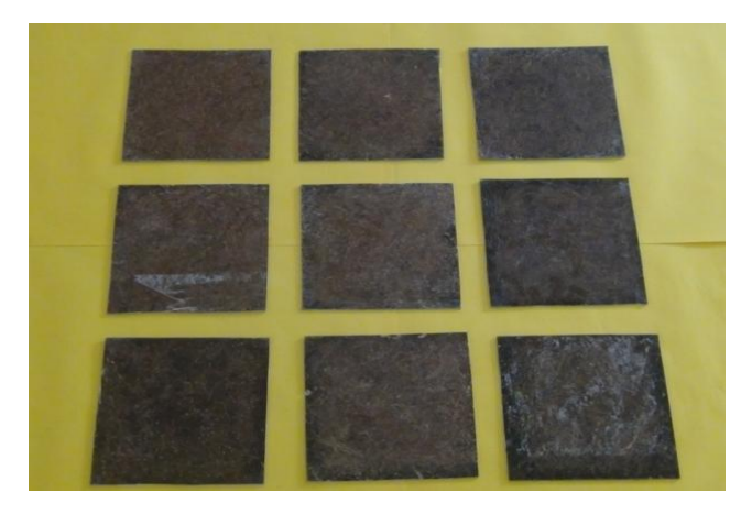
Figure 1 Photographic images of fabricated composite sheets

in the resin matrix (300 mm \times 300 mm) and pressed heavily before removal. After one hour, the composites were removed from the mould and cured at room temperature (28<sup>o</sup>C) for 24 hrs.