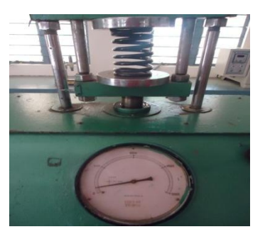
Fig.6.1. Spring testing machine with mono spring

The figure shows you the spring testing machine with mono spring at 100 kilograms. Thus the spring was manufactured by the above mentioned specification. While testing the spring at the load of 100kg, Spring get compressed and rebounded.