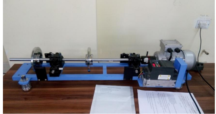
Fig.1. Bearing Fault Simulator System

Experimental are carried on a test apparatus to produce preparing and test data. The rig is connected to the vibs- canner which have piezoelectric transducer vib 6.140 which is mounted on the bearing house when we acquire signal on the bearing. A variety of faults are simulated on the bearing at various speeds and various loads. Different parameters of bearing utilized for the study are recorded in Table 1. Accelerometers are utilized for getting the vibration signals from different stations on the apparatus. Signatures for healthy bearings operation establish the baseline data. This baseline data can then be used for comparison with signatures obtained under faulty conditions. After collecting the vibration signals, salient features are accumulated and compiled to form a feature vector which is fed to omnitrend Software to train it. The data are collected for different fault conditions of bearings. Various defects considered in bearing components are as show in figure 2. A variety of faults on bearings are simulated on the rig at different rotor speed 250, 500, 750, 1000, 1250 and 1500 rpm with different condition no load, one load and two load. The horizontal response and vertical response is taken by the sensor with these condition.