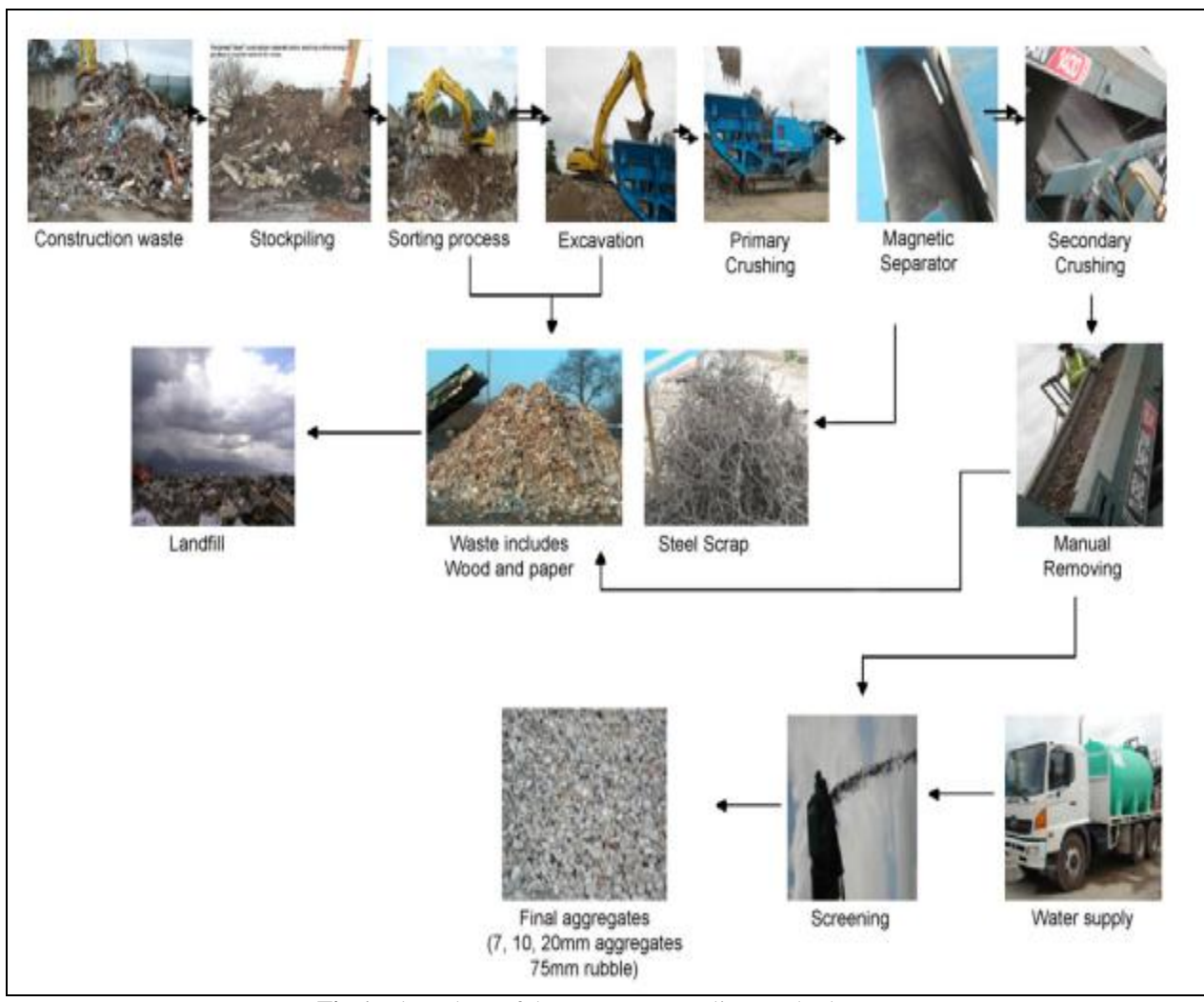
Fig.1. Flow chart of the concrete recycling method.

IOSR Journal of Mechanical and Civil Engineering (IOSR-JMCE) e-ISSN: 2278-1684, p-ISSN: 2320-334X. PP 58-63 www.iosrjournals.org