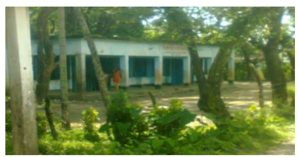
Pic: SangramPunji primary School.

Education is low among Khasi community where education of children rarely progresses past primary level. There are no secondary schools located nearby. The flowing picture showing a primary School of my study area at SangramPunji named SangramPunji primary School.