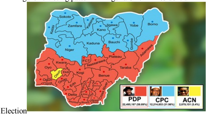
Figure 2: Voting pattern in Nigeria's 2011 Presidential