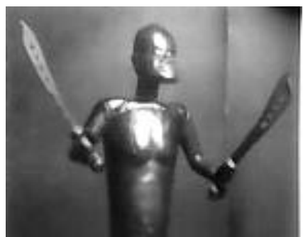
Plate 7 Fon god, Gu Atmore, Stacey & Forman (n.d: 48), Black Kingdoms, Black People

Again, the uses of works of art that are basically propitious are sometimes developed among peoples of Africa to achieve dual beneficial role for the user and family, and occasionally the community. The cult god Gu (plate 7) is abrogated the "ultimate power in life and death" among the Fon, who were known as the warrior clan of the Dahomey people. Atmore, Stacey and Cook (48-50) explain that the god takes charge of protecting the priest, worshippers and community; and also avenges for any wrong against its people and the king.