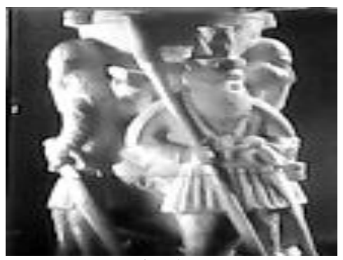
Plate 2 A 16th century Ivory salt cellar Atmore, A and Stacey, G. (n.d: 15) Black Kingdoms Black Peoples.

Security tools need not necessarily have design or pattern on them, in order to be efficacious. The simple fact that some of them have is a testimony to the positive attenuation of its being added. This, at least, could be for aesthetic reason. In this case, many examples abound, even from time past. Sculptors in the Benin kingdom in Nigeria could be acknowledged to be great designers as well, because of the intricate ornamentations they introduced into most of their works. This may not be unconnected with the love of the Benin people for social grandiose on the one part and the artists' attachment to king's and nobles' courts on the other. The ivory salt cellar (plate 2) is a typical example of such flair.