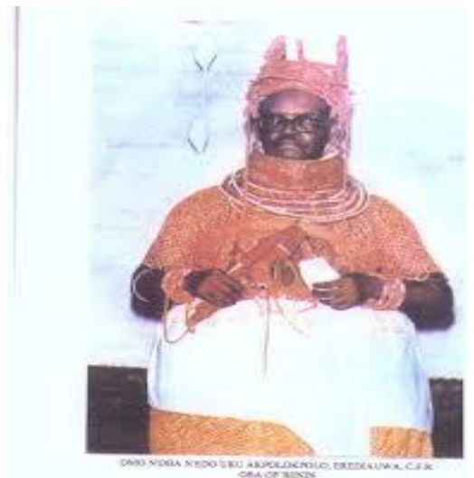
Plate 8 Oba Erediauwa of Benin Kingdom.

The height of creative involvement in the security of man and his environment is reserved and revered in the ade oba (crown) of his kingdom. Therefore, creative adventure, especially the visual arts, is one of the most enduring phenomena (if not the main phenomenon) ever discovered by man himself for his security.