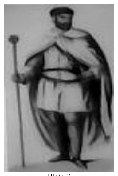
Plate 3 A Knight Templar Hodge, Susie (2009). The Secret History of the Knights Templer.

The ivory work, because of the peculiarity of the subject matter, has been dated as not earlier than around the 16th century (Atmore, Stacey and Forman: 14). What makes it apparent that the salt cellar was not made in Benin, though it could have been done by a Benin carver (free man or slave, as suggested by Atmore, Stacey and Forman) in Portugal, is the fact that the heavy beards were peculiar to knights when it was considered a socially abhorrence by elites of the time; and that the knight in the foreground has a headgear patterned with Masonic symbols: the square and compasses and the cubs of corn. Armed with spear and dagger, and a necklace with the sign of the Red Cross round his neck, and supported with accompanying knights, show the main knight as a nobleman; a Knight Templar— the early defender of the Christian faith (Hodge, 2009). In essence, they are securing safety of lives in and around the Hold land and also defending the property of the kings wherever they domiciled. The elaborate and intricate designs put together into achieving this cellar shows the resplendence that was always attributed to the Knights Templar, which Hodge (2009) proclaims to be the most commanding and influential "military religious order" of the Middle Ages in whole of Europe (plate 3).