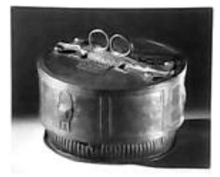
Plate 5 A Brass Container with lid (kuduo). Atmore, Stacey & Forman (n.d: 92), Black Kingdoms, Black People

The land of the Gold Coast is renowned for its wealth of gold, and the land had been reputed to be well traversed by merchants from Europe (wanting gold and ivory), and the Sahara and Sahel (wanting salt and other merchandise) (Davidson, 1991: 87-97). The gold and salt were two very valuable items during the trans-Sahara trade. Various precautionary measures were also adopted in transporting these items, especially the gold dust and ingots. It is, therefore, not out of place for the Akan craftsmen of Ashanti Kingdom to produce brass containers, sometimes with lids, to carry gold dust and other valuables like precious stones (plate 5)