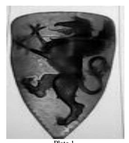
Plate 1 A 15th century ceremonial shield with Florentine workmanship Oliver, Stefan (1991: 23). An Introduction to Heraldry .

Invariably, as the wants of man grew insatiable, the horizon for his search for attainability also expanded; his accessible environment also increased. The very interesting thing about community expansion was the natural creation or development of feudalism. Acquisition of land areas by lords and kings became an increasing appetite. Wars arising through this medium also became inescapable. Weapons of war were largely armour, shield, arrow, spear and sword. The stamping of authority over particular land and people of distant acquisition needed surveillance and they also needed to be in touch with their lord and master. Therefore, the king's messenger en route these lands was an armed courier. He was emblazoned with the insignia or staff of office of his lord and master to distinguish him and as well pin him to his master-lord. These insignias, since this period, became seals of ascription, authority and identification; they became creative properties of different dynasties recorded in histories of many kingdoms (Oliver, 1991). In Western Europe, the prestige of kings and knights (the religious crusaders) was crafted out from the heraldic symbols that were creatively and sometimes painstakingly emblazoned on the ornaments of war (plate 1).