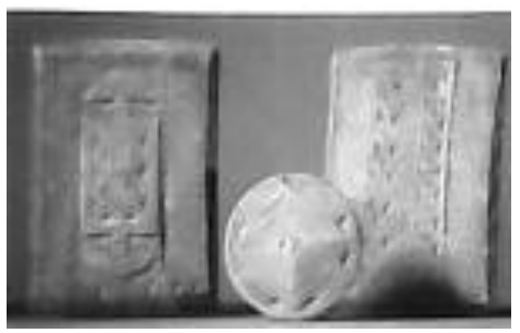
Plate 6 Panko book cover Atmore, Stacey & Forman (n.d: 48), Black Kingdoms, Black People

Fervent adoration of the instrument of religion is universal; preserving the instrument is also spiritually and physically mandatory. The Judaic sect revered the Torah and the codices, Christians look towards the Bible, and Mohammedans still adore the Qur'an. Because the ancient copies of most religious literatures were handwritten in scrolls and parchments, sometimes with instructive, graphic illustrations, they were preserved in containers, and in boxes like the wooden parchment boards carved in Nupe, Nigeria (plate 6).