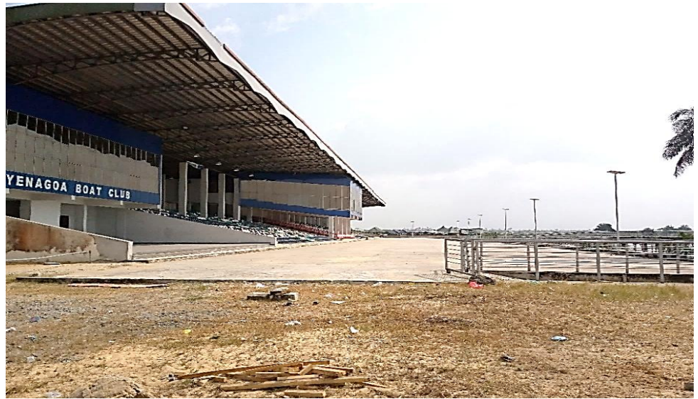
Figure 5: A Boat Pavilion at Ox-Bow Lake in Swali

Identified Approaches for Sustainable Development of Ecotourism in the Study Area