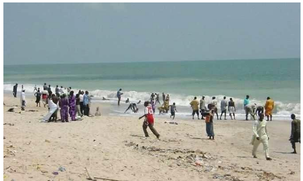
Figure 3: Okpoama Beachin Brass LGA,Bayelsa State

Kolokuma/Opokuma LGA ecotourism sites are 3 located at Egbedi, Odi and Gbaran-Ubie. The sites resources are characterised with forests, creeks, rivers, lakes, beach, seashells, exotic wildlife, flora and fauna, serene atmosphere and cultural festivals. The present status of these sites and resources are underdeveloped and suitable for oceanographic, zoological, biological and recreational activities that will promote through research and investment for economic growth and development. The sites and resources are threatened by human impacts from oil and gas exploration, lumbering and poaching activities (see Table 3). In Nembe LGA, the ecotourism sites and resources are located Edumanon and Nembe areas. The located are depicted by forest reserve ((Edumanon Forest of wildlife of fauna (chimpanzees, birds of various species and aquatic life and exotic flora), mangrove swamp creeks and rivers, and cultural festivals (War Canoe regatta and rich cultural displays). From the data in table 3, the status of the sites and resources are underdeveloped but suitable for oceanographic, zoological, biological and recreational activities and research expeditions. The sites and resources are threatened by human impacts from oil and gas, lumbering and poaching activities that may affects the quantity and quality of resources in the sites (see Table 3).