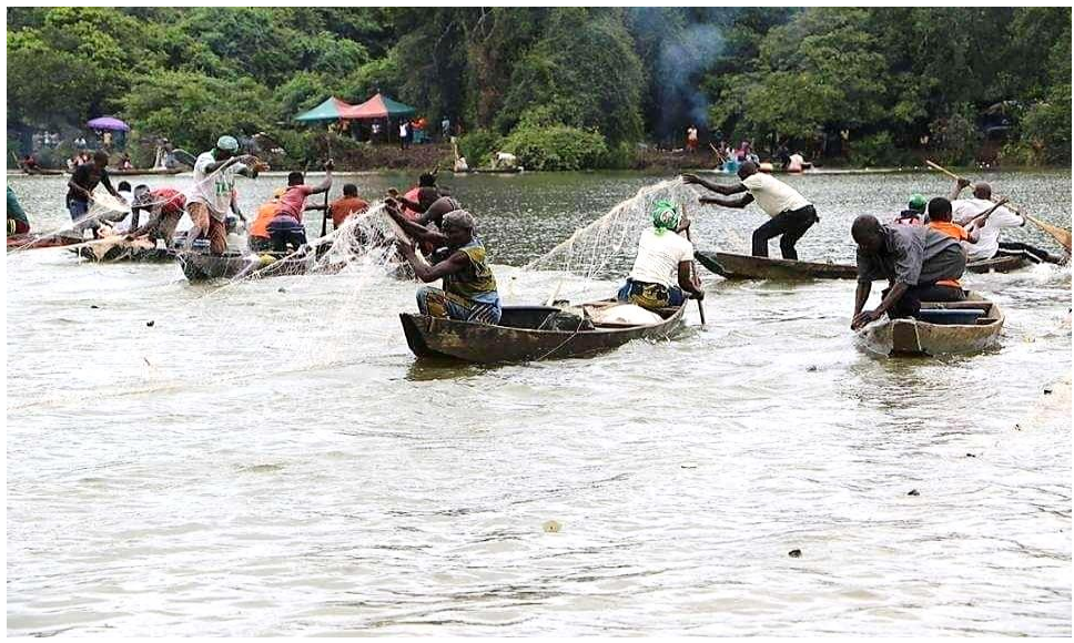
Figure 4: Fishing Festival at LakeEffi