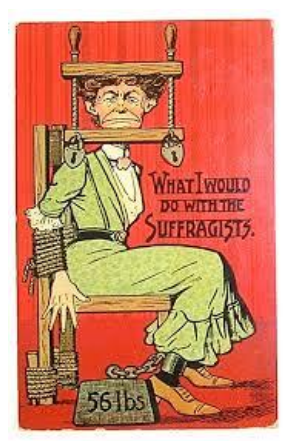
Figure 1 What I Would Do with the Suffragists, an American Anti-Suffragette Cartoon 1908