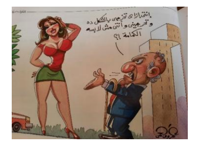
Figure 8 Amr Fahmy - Qahwat Masrawy Caricatures of Egyptian Daily Life 2021 "How could you embarrass me like that and go out without wearing a face