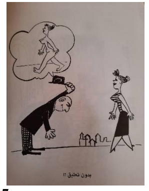
Figure 7 Salah Jahin Complete Works of Caricatures 1956 – 1962 "No Comment"