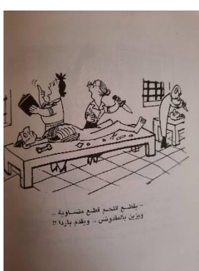
Doctors Salah Jahin Complete Works of Caricatures 1956 – 1962 "Cut the meat into cubes and add parsley .. serve it cold!"