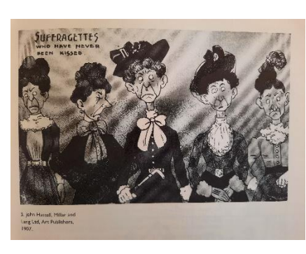
Figure 5 Suffragettes who have never been kissed, 1907