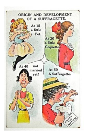
Figure 4 Origin and Development of a Suffragette" - Postcard, USA, c.1909