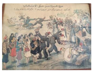
Figure 11 "Preventing Women the Right