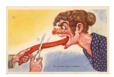
Figure 2 Early Dutch 1900s cruelly comic anti- suffrage, antifeminist postcard, from the Netherlands, depicting a woman having tongue cut off to stop her gossiping (silencing women) - postcard reads "en nu niel meer roddelen", printed in Holland, possibly 1930's