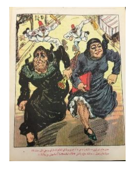
Figure 10 Cartoon of Huda Hanim Sha'rawi