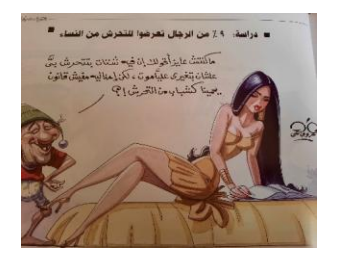
Figure 9 – Study: 9% of men were sexually harassed by women Amr Fahmy - Qahwat Masrawy Caricatures of Egyptian Daily Life 2021 "Didn't want to tell you that women sexually harassed me to avoid making you jealous ... But