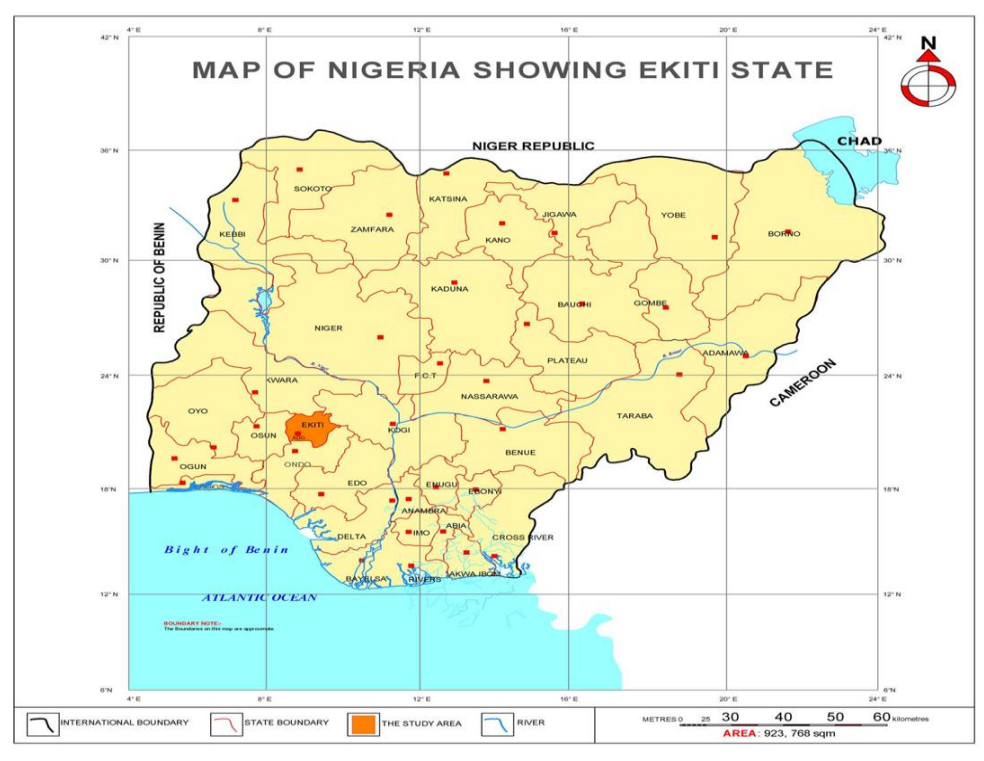
FIG.1 MAP OF THE SUDY AREA WITHIN NIGERIA

The population of Ado-Ekiti in 2006 was 308,621. The people of Ado Ekiti are mainly of the Ekiti subethnic group of the Yoruba and Edo peoples. Edo-Ekiti or Ado-Ekiti (the Yorubas typically referred to a person of Edo origin as Ado which is why the generals and princes/kings from Benin Empire in Yoruba lands are called Prince/Oba Ado) as it is now known is often categorized under the Yoruba ethnic group as a result of acculturation over the last few centuries. Ado Ekiti City has a State owned University the University of Ado Ekiti now Ekiti State University Ado-Ekiti, a privately owned University; Afe Babalola University Ado Ekiti, a Polytechnic ; the Federal Polytechnic, Ado-Ekiti, Federal University Oye, (FUOYE), Oye-Ekiti, privately owned Polytechnic Crown polytechnic, Odo, Ado-Ekiti