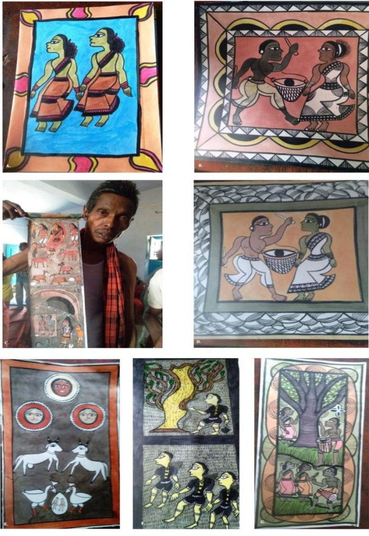
PLATE 1. Different motiffs of Potchitra art form: A. Sokhi bilar; B. Dhamsa madal 1; C. Shambhu chitrakar showing roll on potchitra art form depicting pursa katha; D. Dham madal 11; E. Local deities and animals; F. Sorgo donshon (upper chitra)-Hori khela (lower chitra); G. Dhamsa madal 111

Plate 1: Different motifs of Bengal Potchitra