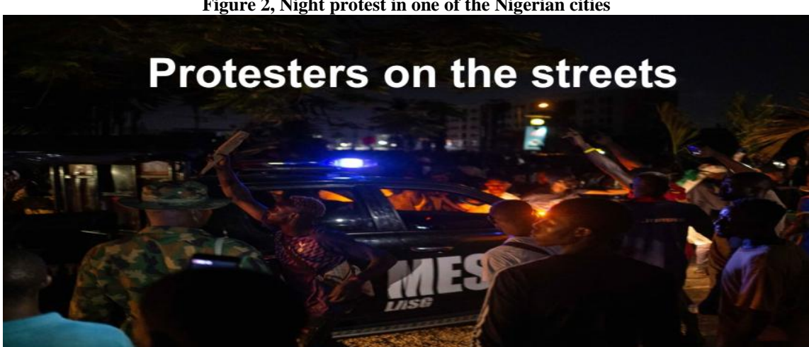
Figure 2, Night protest in one of the Nigerian cities