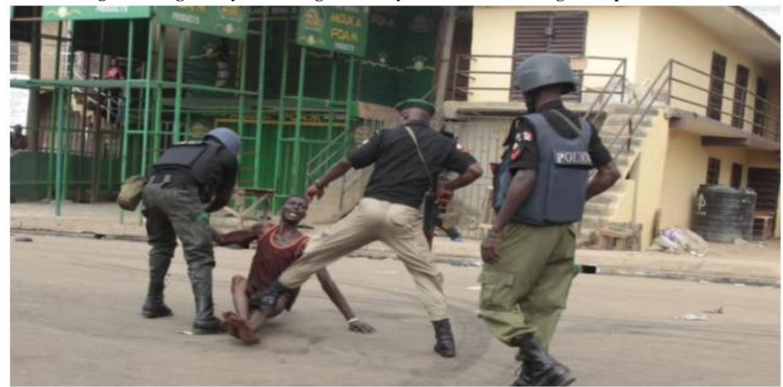
Figure 5. Nigerian youth being beaten by members of the Nigeria's police force

Furthermore, there are various examples of people who have been raped, harassed, flogged, extorted, injured or killed by the unit of SARS (Amnesty International, 2020). They further, reported that SARS has been responsible for "at least 82 cases of torture, ill-treatment, and extra-judicial execution" in a stretch of a just over three years, primarily targeting young, poor men. These cumulative challenges that put Nigeria youths to form many movements to removed themselves out of nefarious exploitation, harassment, extortion, extrajudicial killings, rapes and other ill-treatment perpetrated by Nigerian police against young Nigerians. The figure below shows one of the numerous cases of Nigerian youths being brutalised by the police.