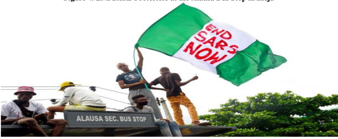
Figure 4. ENDSARS Protesters at the Alausa Bus Stop in Ikeja