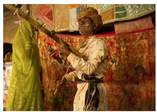
Figure 8 Bhopa and Bhopi performing Pabu ji ki Phad