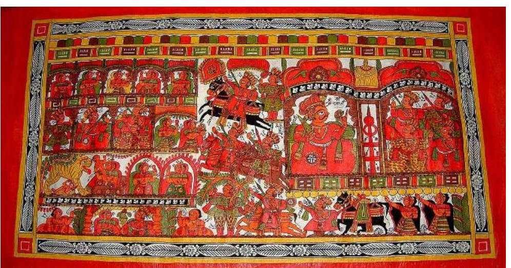
Figure 2 Phadchitra of Pabu ji Rathore