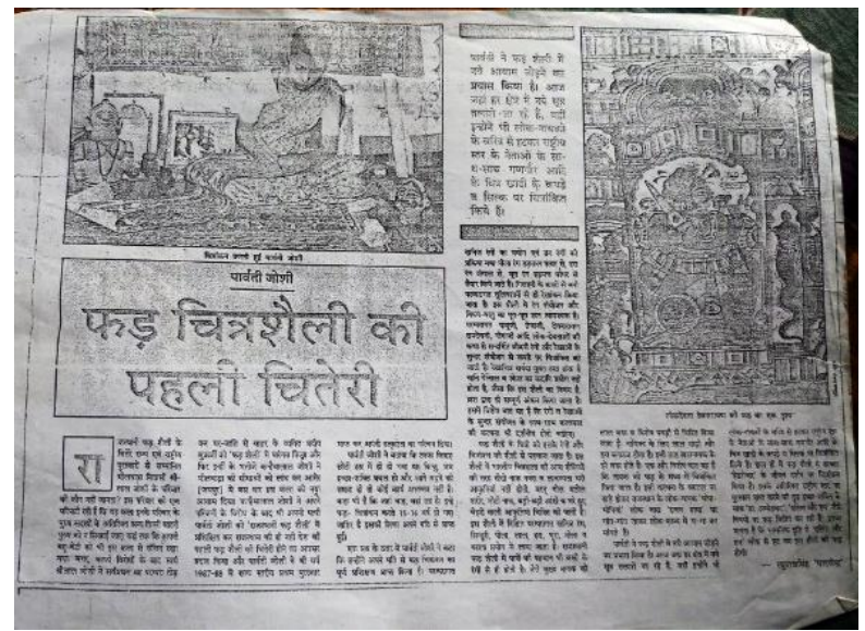
Figure 4 Newspaper cutting

"Phadchitra of Rajasthan: Significant contribution of women artists among the unique art forms"