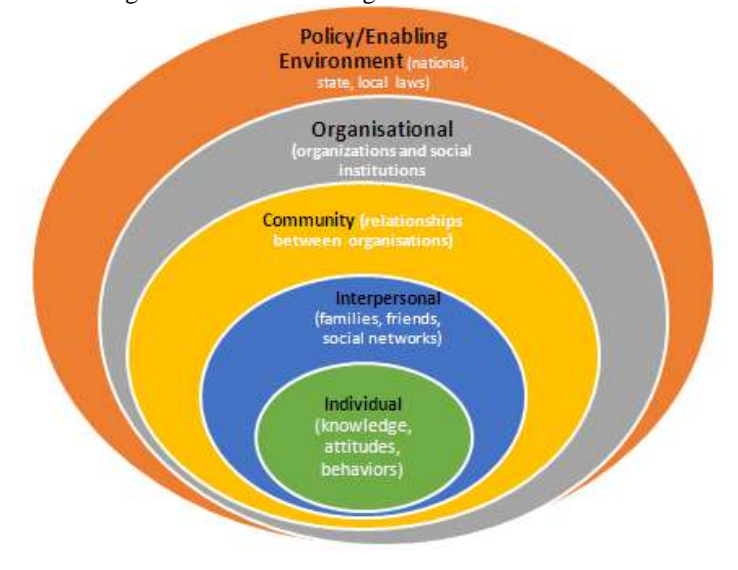
Figure 2.1: Social Ecological Model Framework

The development of the "Block the Circumstances" conceptual framework was guided by the Social Ecological Model Framework and informed by the patterns, circumstances, psychological impacts, and human rights violations in early marriages. The environment influences the female teenage marriages and the reversal is possible to prevent such marriages. In the 2020 study conducted by the researcher in Mashonaland Central Province of Zimbabwe, it was noted that the Social Ecological Model Framework of Theory influenced the circumstances and patterns of female marriages that usually results in negative psychological impacts and violation of female teenagers' human rights.