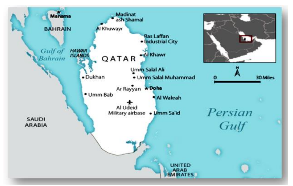
Figure 1– Qatar's geographic location

Qatar is a small-sized country located in the heart of the Gulf region (Figure 1).<sup>1</sup> Throughout decades there has been competition going on between Saudi Arabia and Iran in trying to enforce dominance and power on the other states in the Gulf Region. However, both countries avoided escalating problems and turning them into armed conflicts. On the contrary, Saudi Arabia has always implemented soft power policies and strategies in dealing with the threats and challenges coming from Iran<sup>2</sup>. Also, it is significant to state that Egypt has been among the competitors as it has seen itself as the shield protector of the Arab World<sup>3</sup>.