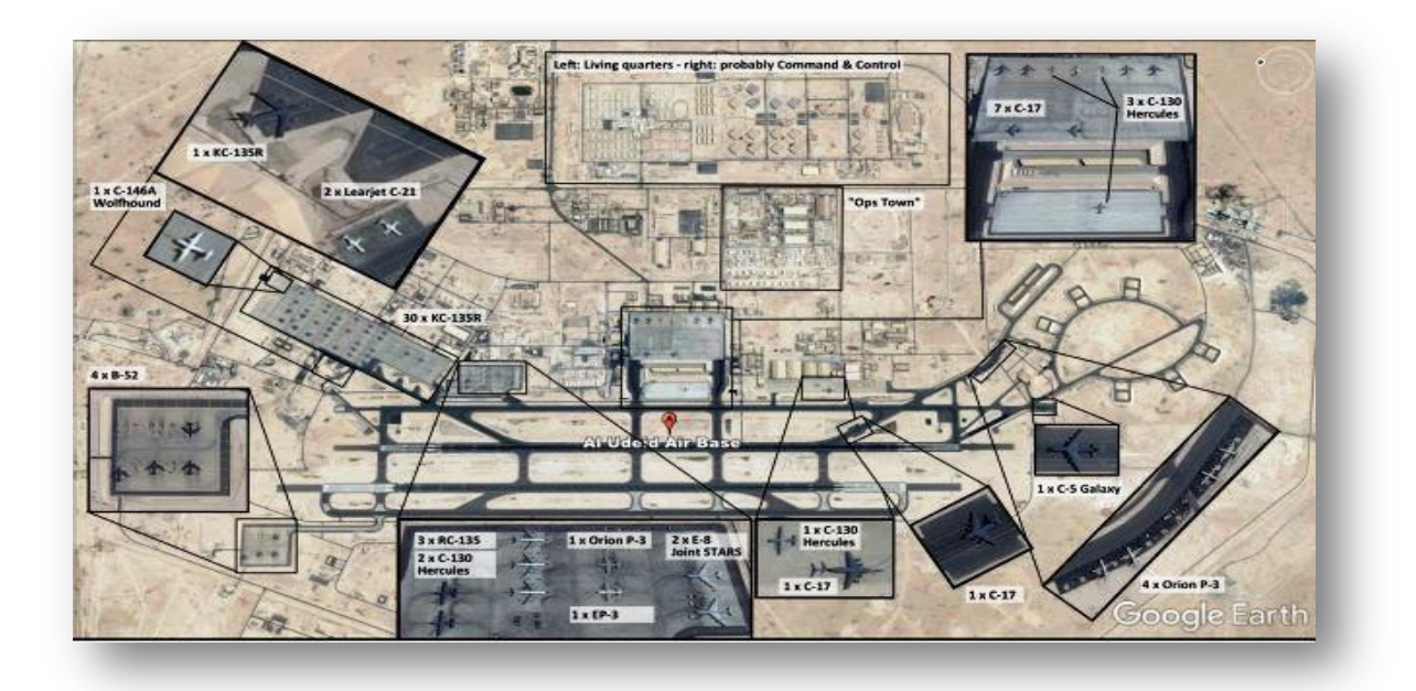
Figure 3- Satellite view of Qatar's Al Udeid USA Air Force Base