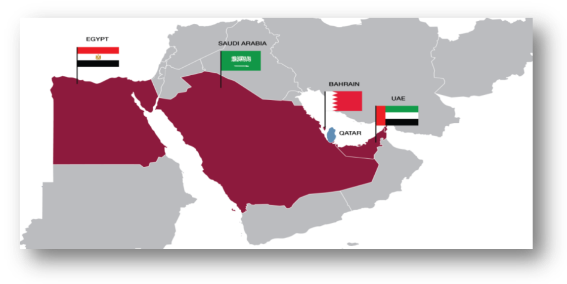
Figure 4– Government Communication Office Of Qatar (GCO, 2018)

sanctions imposed on Qatar and instead stayed neutral, with the Kuwaitis playing an influential role as a mediator in these crises.