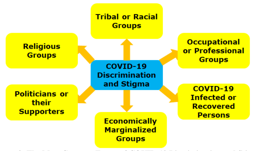
Figure 3: The Most Common Forms of COVID-19 Discrimination and Stigma

Discrimination and Stigma against COVID-19 Infected or Recovered Persons: The first groups to complaint about discrimination and stigma against are the COVID-19 Infected or Recovered Persons and their relatives.