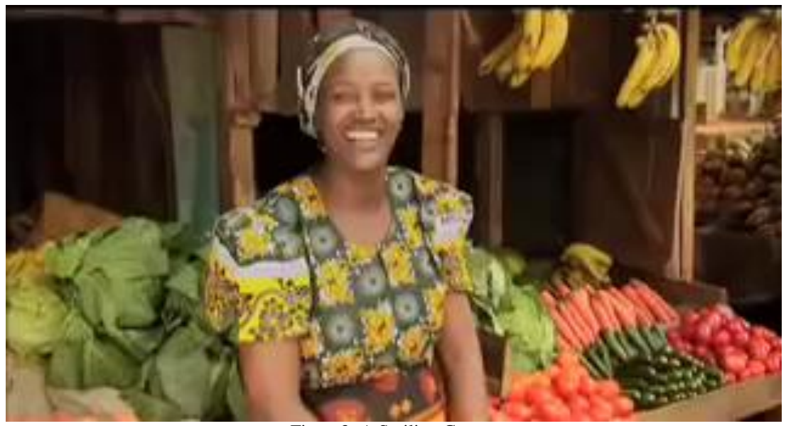
Figure 3: A Smiling Grocer

The non-verbal language portrayed by individuals in advert11 explicitly indicate that all participants, are happy to be members of this institution. There is a lot of relaxation in their utterances, and they all wear smiling faces and gaze in agreement. See Figure 3.