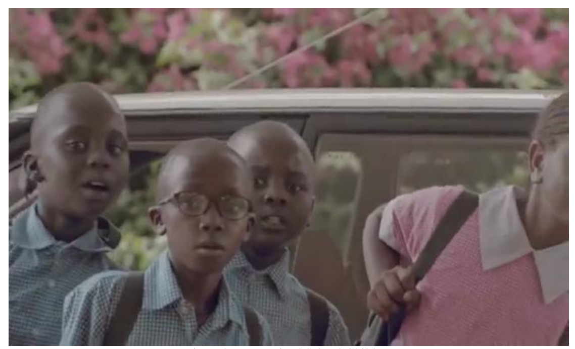
Figure4: Mesmerized School Children

Advert 17, begins by displaying a young couple that portrays joy, contentment and laughter. They laugh and hold each other's hands strolling leisurely in town. When the two get into the bank they are received like executives by bank employees and accorded great attention. The lady poses this question "is this really a bank?" Everything that takes place is not only entertaining but also intriguing. In the banking hall there is beauty and colour that is addictive. The viewers are treated to a tour that if considered can bring about the same joy and contentment in their lives. The bank employees are seen wearing smiles and attentive gazes Figure 5 displays this argument: