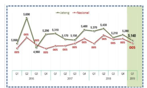
Figure 1. Quarterly Years On Years Economic Growth Rate Development (in percentage)

A country has a good economy if within a certain period of time or successively it has always experienced increases and decreases in less than one year. However, in reality the economy that occurs in general does not always experience an increase or can be said to fluctuate. Therefore, a country needs to carry out economic development aimed at improving the country's economy. Economic development is an effort made by the government by making changes for the better in the aspect of a country's economy [1]. The preparation of regional economic development plans and policies needs to take into account the potential and capacity of each of these regions as well as the problems that are being and will be accepted. So that economic development efforts carried out in each region can be adjusted to the conditions of each region.