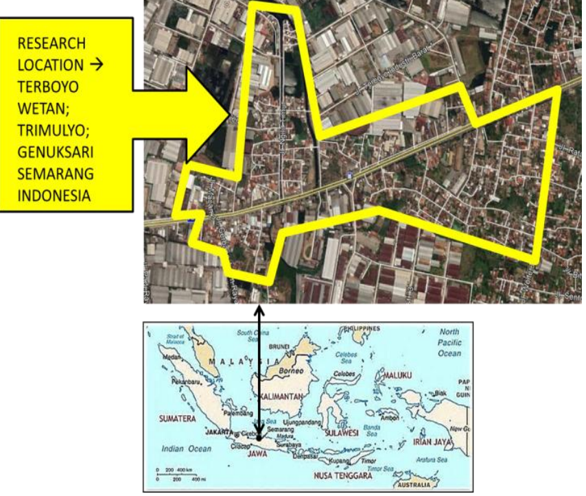
Figure 2: Research location: Terboyo Wetan, Trimulyo and Genuksari Sub-Districts, at Genuk District, Semarang - INDONESIA.

These three subdistricts are located in Genuk industrial area Genuk who always suffers from tidal flooding. Soil conditions are categorized as high decrease of land subsidence, 8-10 cm per year. Populated with 4,573 inhabitants of 1,034 families indicated approximately 4 people per household. This neighborhood should be categorized in normal crowdness. With the average area of the house is not more than 40 square meters, meaning that each inhabitant has a space of at least 10 square meters. But for an average land area of building is about 70 square meters.