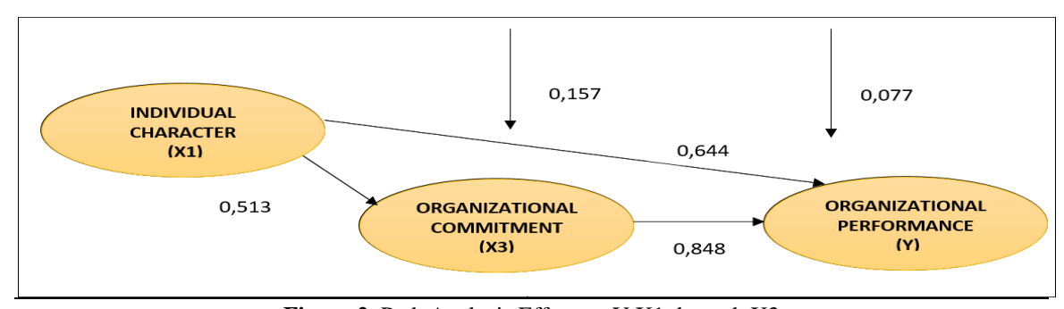
Figure 2. Path Analysis Effect on Y X1 through X3

Based on the partial path analysis above, it can be described as follows. The analysis is an analysis in line with the structure of this sub-image.