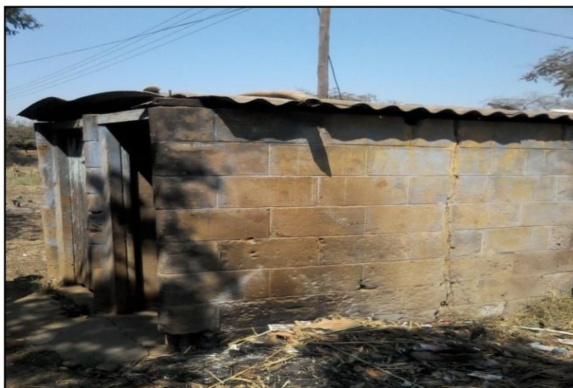
Plate4.3: Pit latrine Flush toilets

Pit latrines were used by 28% of the respondents. These toilets were old, showing no evidence of recent upgrading (plate 4.3) and they were abused by the users who failed to properly dispose of excreta into the squat holes. Similar to the pour flush latrines, pit latrines were shared among the community. These toilet facilities produced unpleasant smell and had no vent pipes to reduce odour. When rating the state of the pit latrines, none of the residents rated them as very good, only 10% rated them as good, 76% as bad and 14% rated them as very bad. Pit latrines were rated on the bad side by 90%. For the 10% who rated them as good, their only reason because they were comparing them with Pour-flush toilets.