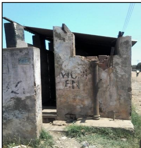
Plate 4.1: Outward appearance of a Pour flush latrine in Rimuka SQ/GB