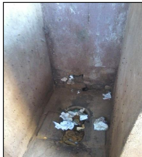
Plate 4.2: Inward appearance of a Pour-flush latrine in Rimuka SQ/GB

The majority of the research respondents (52%) were