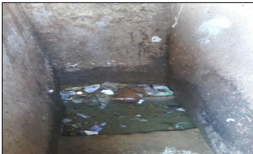
Plate3.4: Pour flush latrine promoting breeding space for flies and mosquitoes

infections (such as trachoma and epidemic conjunctivitis). Also observed was the absence of hand washing facilities in and near the toilets, creating possibility of oral-route transmission of faecal contamination.