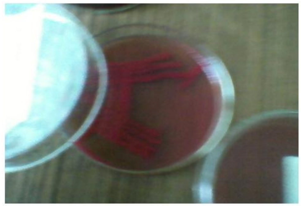
Plate II: Red Shigella colonies on XLD Agar