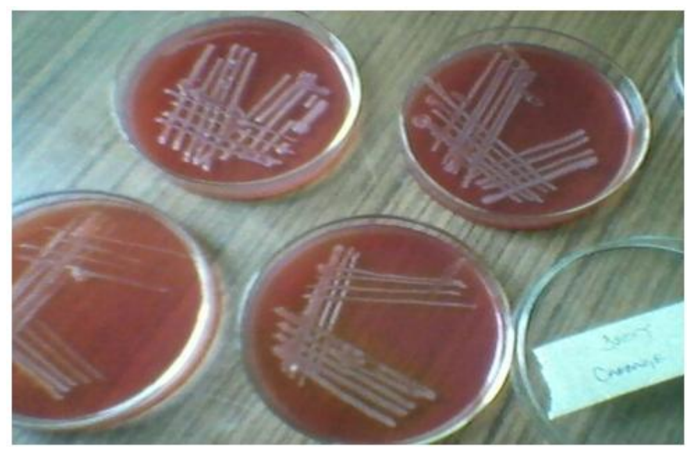
Plate I: Colour change in (EMB) due to activities of lactose fermenters and non-fermenter