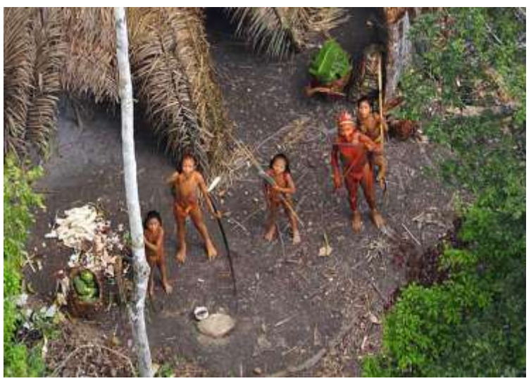
Figure-5 Sentinelese Tribes