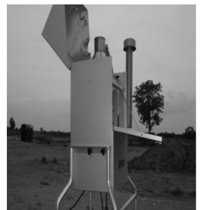
Figure 2.1: High Volume sampler installed at the proposed site