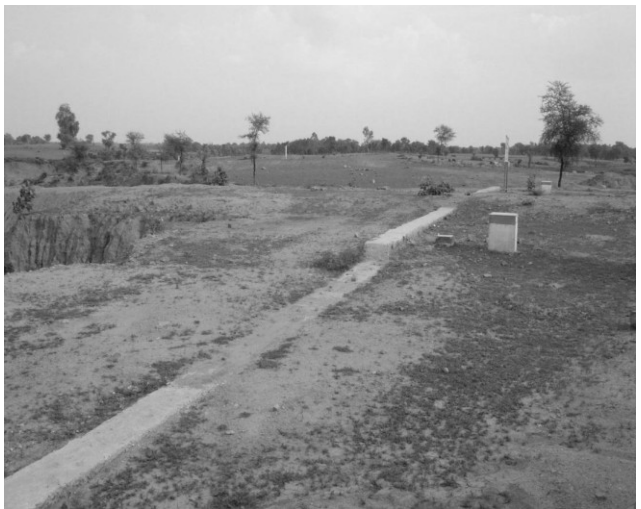
Fig 1.2: Proposed Site for Dam Construction