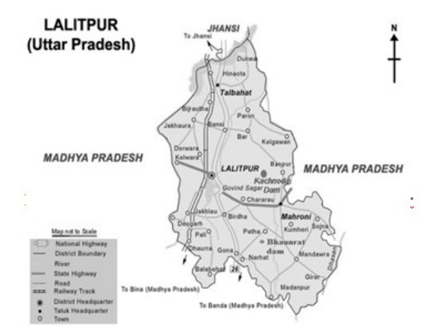
Fig 1.1: Maps of Uttar Pradesh Showing District Lalitpur