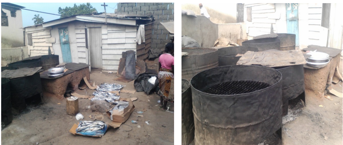
Picture 4: A fish monger drying her fish All the fish mongers use the crude method of steaming their fish as can be seen in Picture 4 and 5. This method possesses negative health and environmental issues.

Figures 4.1, 4.2 and 4.3 depicts the kind of surroundings the people of Bukom lives in and also how they prepare the kenkey. They eat some and sell the remaining for income to support their families Besides kenkey making, others are involve in fish mongering activities as their main source of sustenance