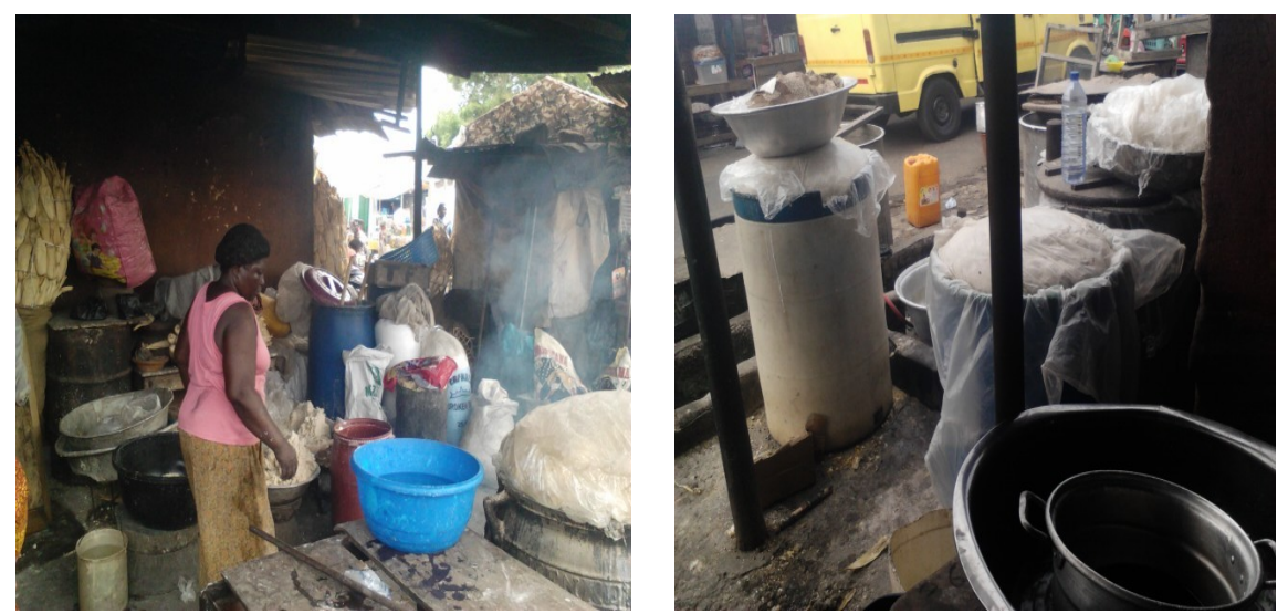
Picture 1: Women engaged in kenkey making in Bukom Picture .2: Utensils with corn dough

The Figures below show the occupation of the local residents and were taken 200 meters from the coast of Bukom.