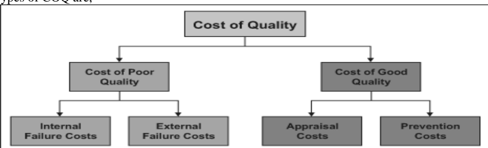
Figure 1:Types of COQ

The total quality costs are the sum of prevention, appraisal and failure costs. They represent the difference between the actual cost of a product or service and the potential (reduced) cost given no substandard service or no defective products. [15] Quality costs are important considerations for information management and information technology. In global world, the most important way to survive in the competitive environment for firms is using quality as a core strategy.[3].COQ programs provide a good method for identification and measurement of quality costs, and thus allow targeted action for reducing the COQ and thus improving the quality. Types of COQ are,