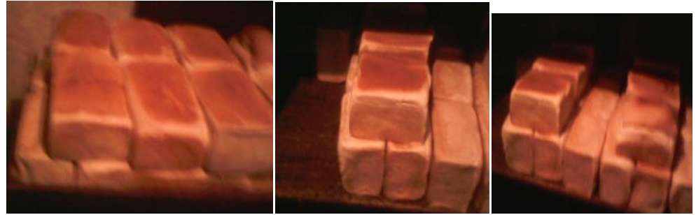
Sample B - 100/0