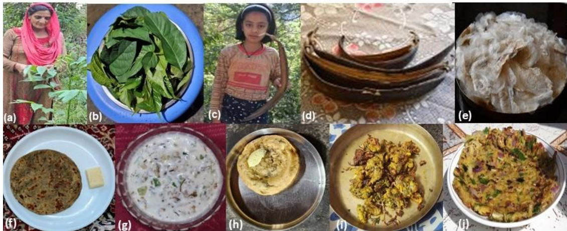
Fig.3 Edible Uses: (a-b)Harvesting O. indicum leaves, (c-e) O. indicum harvesting seeds. (f) Parantha , (g) Rayata (h) Kachuri , (i) Pakor as, (j) Chilla-Kachru . (Source: Author Compilation).