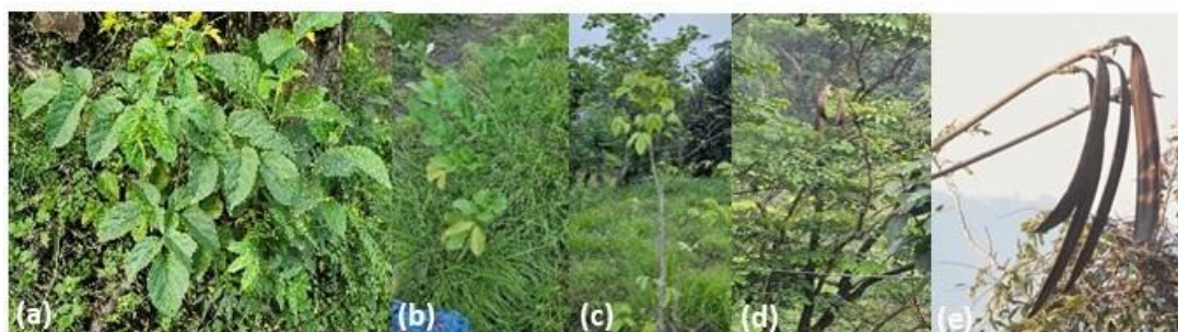
Fig.2 Morphology, Habit & Habitat (a, b) O. indicum young plant (c, d) Mature tree, (e) Tree bearing fruits.

The fruit is a woody, red-brown capsule, septicidal dehiscent with two valves, measuring 40-70 cm by 5-8 cm. The seeds are winged all around, except at the base, allowing for efficient dispersal (Fig.2).