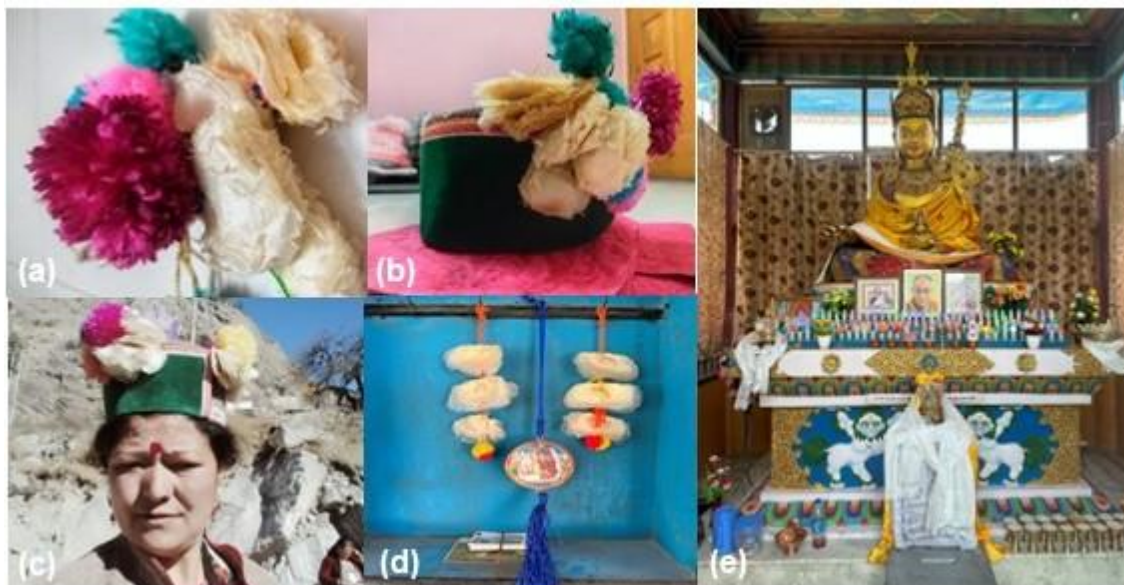
Fig.4 Cultural Uses: (a-c) O. indicum seeds adorning a Kinnauri Cap (d) Seeds in handcrafted decorative items, (e) Seeds for Decoration and Worship.