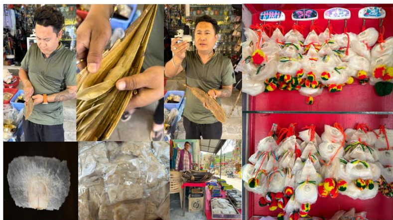
Fig. 5. Seeds offered for selling in Rewalsar Mandi HP.

Other Uses: It is used as fodder. Non-drying oil is extracted from its seeds that is used in the perfumery industry; stem bark and fruits are used as mordant, with the former also yielding a ‘khaki’-coloured dye and its wood is used to make matchboxes (Jain, et al , 2003)