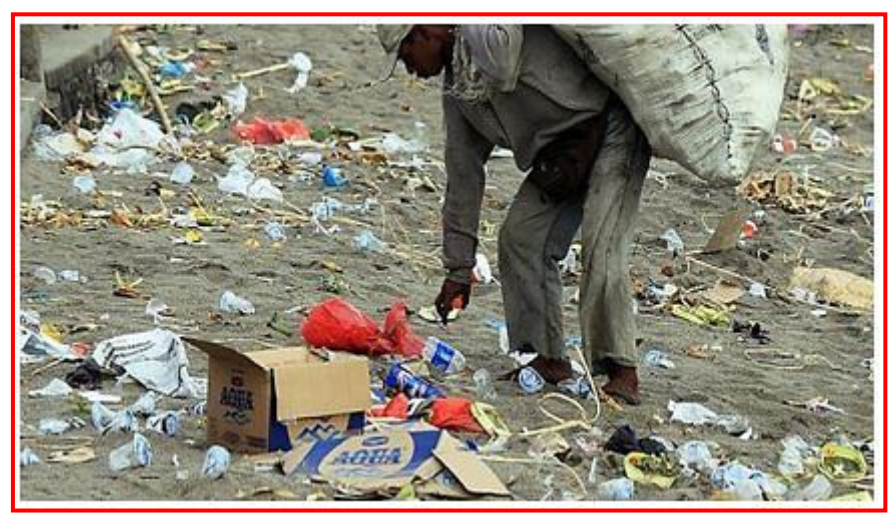
Figure 3. Collection of different plastic packaging in bags, cardboard ... discarded in the main street of Basoko.

We analyzed the qualitative data from the questionnaires and semi-structured interviews with the SPSS version 16.0 program. This program was used to code all the data collected in the field. It proved to be very useful during the analysis of the data, in this case the production of averages, frequency tables and contingency tables. The processing of the data first focused on the search for percentages and arithmetic averages of the variables analyzed. To better analyze our data, we used descriptive statistics.