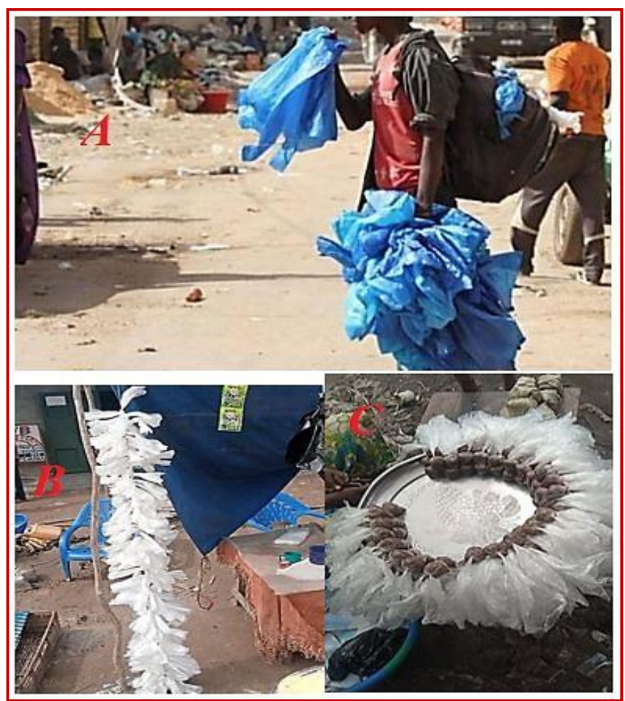
Figure 2. Sale of plastic packaging (A&B) and food packaged for sale (C) in the vicinity of Basoko Central Market (Photos, Afundi Ndetshala Didi, May 2022)

To collect data, we drew a sample of 30 garbage cans at least twice a week for 6 months (Figure 2 and 3). Then we sorted the waste in such a way as to collect a different type of waste in each bag and weigh each bag containing a different type of waste by taking the weight of each type of waste collected. Finally, these data were recorded in a notebook. During the surveys in the city of Basoko, we interviewed 390 people, i.e., 90 people per commune.