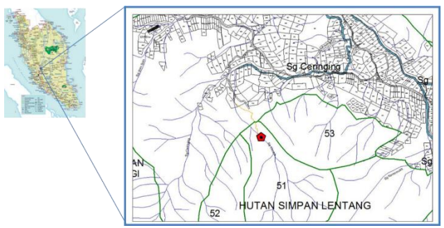
Figure 1.Location of Study Site at Janda Baik, Pahang

Ulu Tampik Waterfall (UTW), which is located at Janda Baik, Bentong, Pahang, Malaysia, was selected as the study site. This location is an approximately 45-minute drive from the city centre of Kuala Lumpur. The surrounding area of UTW in Compartment 51, Lentang Forest Reserve (LFR) is generally unique, and it serves as an exciting recreational area. In terms of topography, this study site is located within the Titiwangsa Range.LFR is a hilly area, with an altitude between 600 m and 800 m above sea level.The main physical element of LFR is its unique, clear waterfall.UTW and its surrounding arearepresent a popular leisure site for the residents of Janda Baik and visitors, both locals and foreigners ( Figure 1 ).