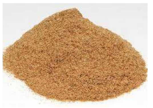
Plate 2: Dried corn cob flour