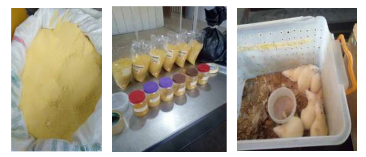
Plate 3: Garri

Keys: GCCF-AD is 100% garri diet; GCCF-BD to GCCF-FD are diets made with blends of 95:5, 90:10, 85:15, 80:20 and 75:25 garri and corncob flour respectively; Vit.mix – Vitamin mixture; Casilan 90 – High protein powder