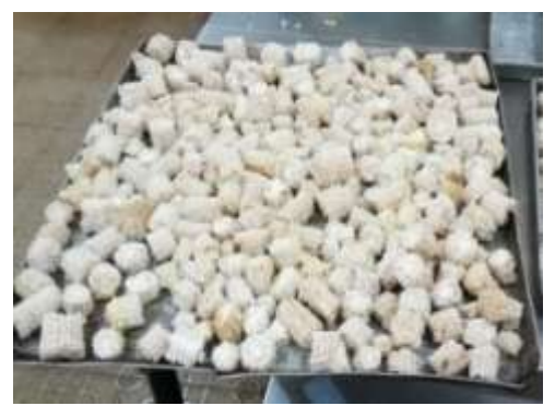
Plate 1: Corn cobs

The corn kernels were removed manually from the ears of dry maize. The corn cobs obtained were sorted to remove defective ones after which they were washed thoroughly, cut into pieces and dried in a hot air oven (Gallenkamp, England) at a temperature of 65^{\circ} C for 6 h. The dried pieces of the corncobs were milled into corncob flour using attrition mill (Bamfords No2, United Kingdom). The milled corn cob flour was finely sieved. The flour was further dried, cooled and packaged in an air-tight container.