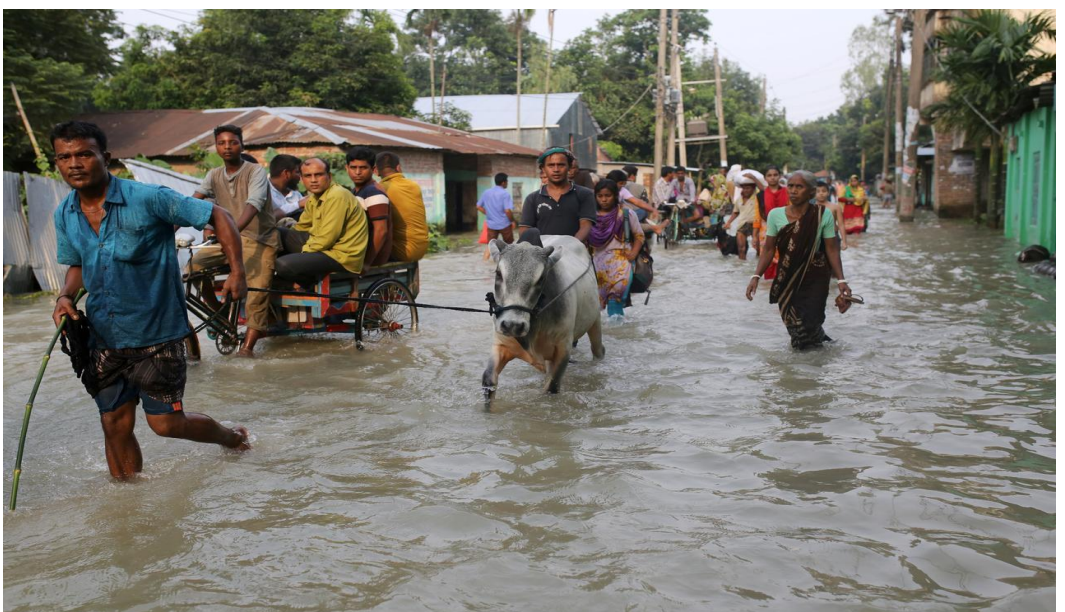
Fig. 6. Flood Water Get Inside of Local Villages and Homes (Newspaper Daily Sun 28/07/2017).

From Fig. 6 we can see that people leaving their homes from flood-affected areas to higher areas to stay safely with their family. They will be back to their home again after the flood but till then they lost everything such as home, agricultural land, and crops.