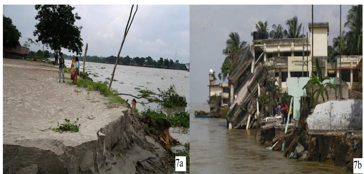
Fig. 7. People Lost Their Home and Personal Properties During Flood After Breaking River Embankment 2017 (Newspaper Daily Sun 28/07/2017).

Providing both immediate and long-term healthcare and support. It is a typical wonder for Bangladesh to observe unusable and additionally destroyed streets due to flood which makes barriers to drive and move. The city and village waste management system are negatively affected during flood, with garbage scattered all over the clogging drainage system and the polluting environment in both the countries according to (Jha et al., 2012; NAPA, 2005; Dasgupta et al., 2010) [22] [23] [24].