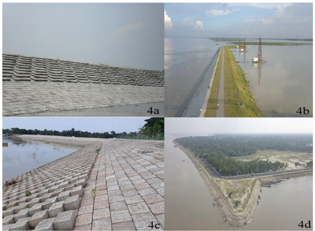
Fig. 4. Newly developed Jamuna and Padma river embankment maintaining proper slope stability factor of safety.