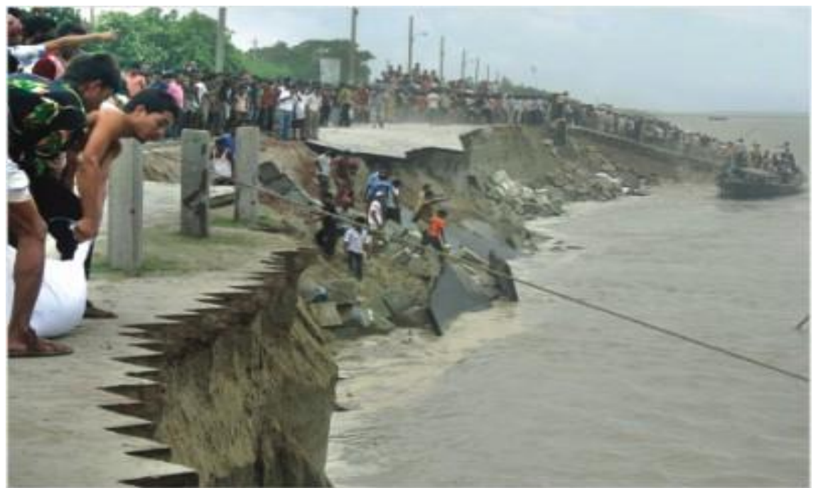
Fig. 2. River Embankment Broken Shirajganj Area (Jamuna River Side).

There are few causes of failure known were a breach of the river embankment, cutting by the general public, overflow, erosion, seepage, and sliding. moreover, Furthermore, supervising throughout construction leads to poor-quality earthworks with the utilization of inappropriate soil materials, too little or no clod breaking, inadequate compaction and or no too little parturition of dirt layers, the utilization of inferior materials, inadequate maintenance, stream migration and cutting by the general public. Among several reasons, the improper style methodology and construction procedure square measure prime and one in all the foremost vital causes of river embankment failure.