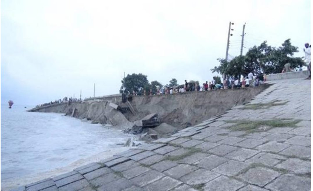
Fig. 3. Food Breaks River Embankment Which Is Made by Only Concrete Block and Soil.

During the rainstorm, extensive over bank spills, bank erosion and bank line shifts are typical. The slow relocation or moving of channels of the significant rivers in Bangladesh add up to anyplace between 60m to 1,600m every year. In a typical year, around 2,400 km of the bank line encounters significant erosion. The unpredictable moving conduct of the rivers and their infringements influence the country's floodplain population as well as urban development places and foundations.